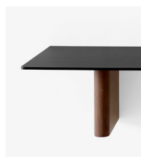
→ Walnut & Black aluminium