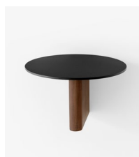
→ Walnut & Black aluminium