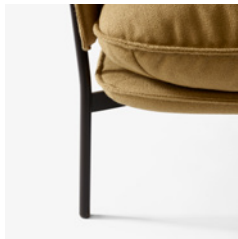
Warm black powder coating