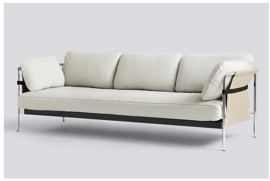
Linara 311, Natural outer canvas, Chrome frame