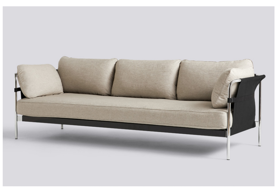
Ruskin 05, Black outer canvas, Chrome frame