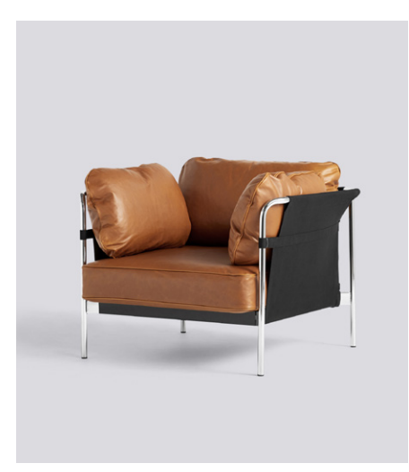
Silk leather Cognac SIL0250, Black outer canvas, Steelcut 975, Natural outer canvas, Chrome frame