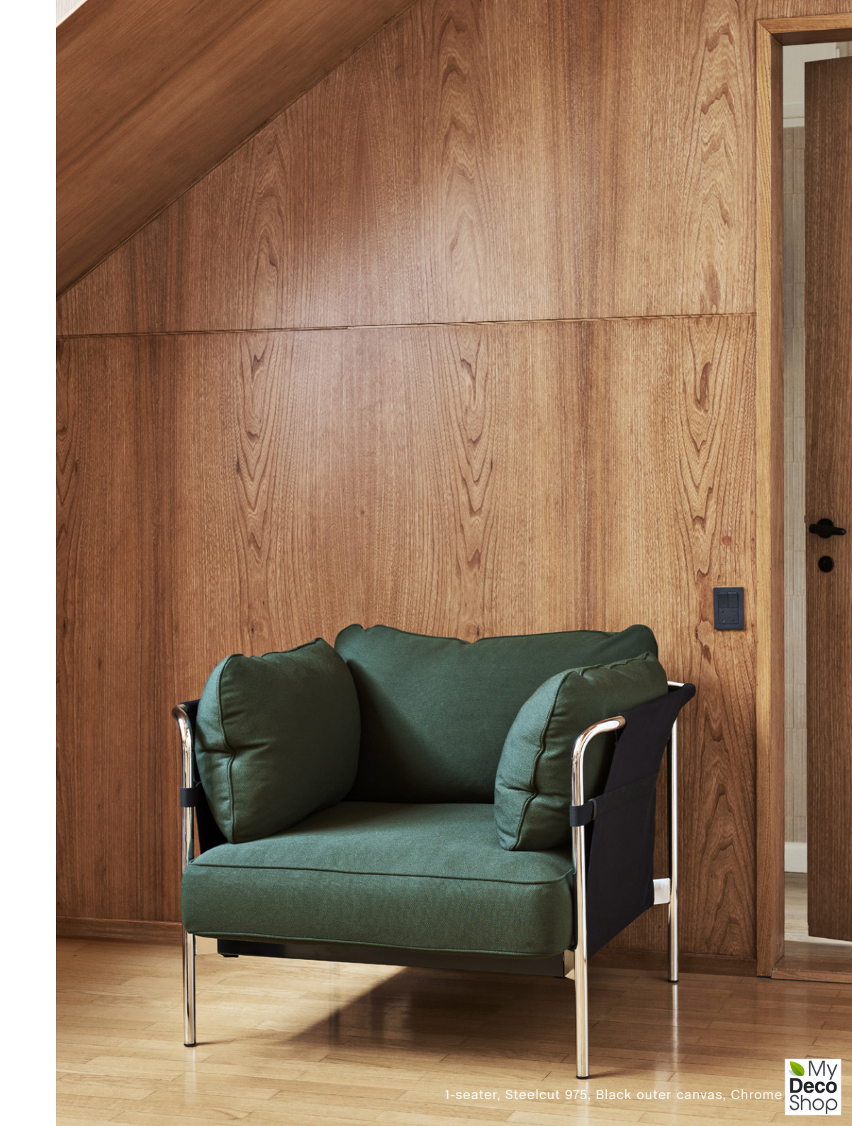
NATURAL CANVAS 100% LINEN