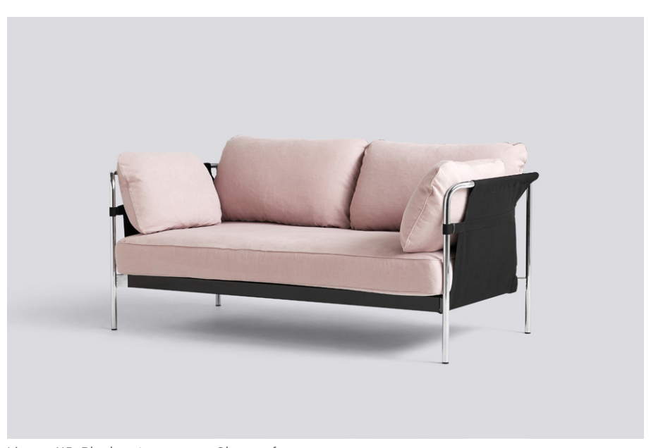
Linara 415, Black outer canvas, Chrome frame