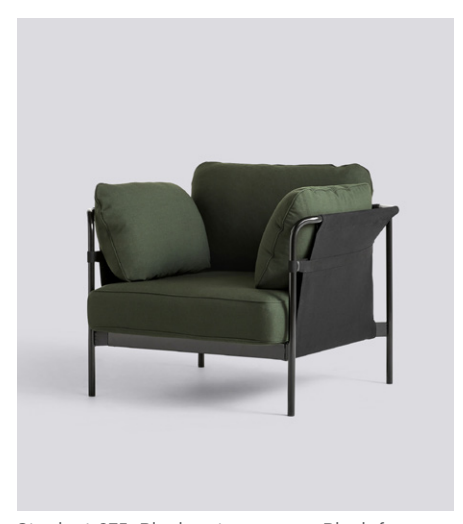
Steelcut 975, Black outer canvas, Black frame