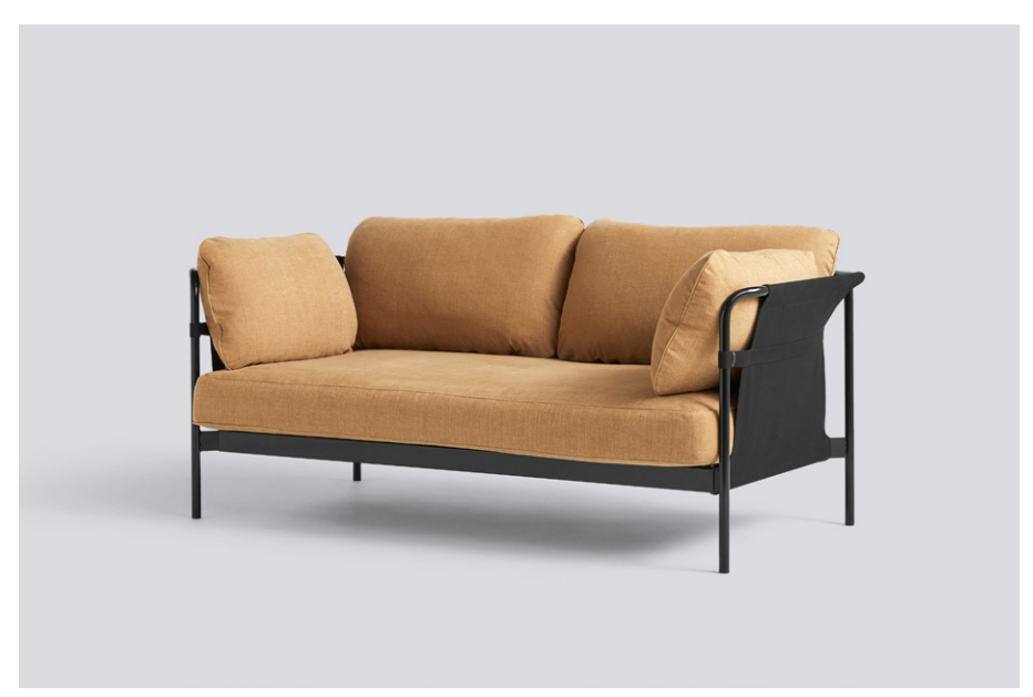
Linara 142, Black outer canvas, Black frame