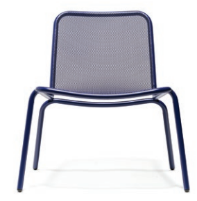
STARLING LOW CHAIR [ 67 x 69 x 69 cm ]