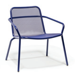
STARLING LOW ARMCHAIR [ 67 x 69 x 69 cm ]