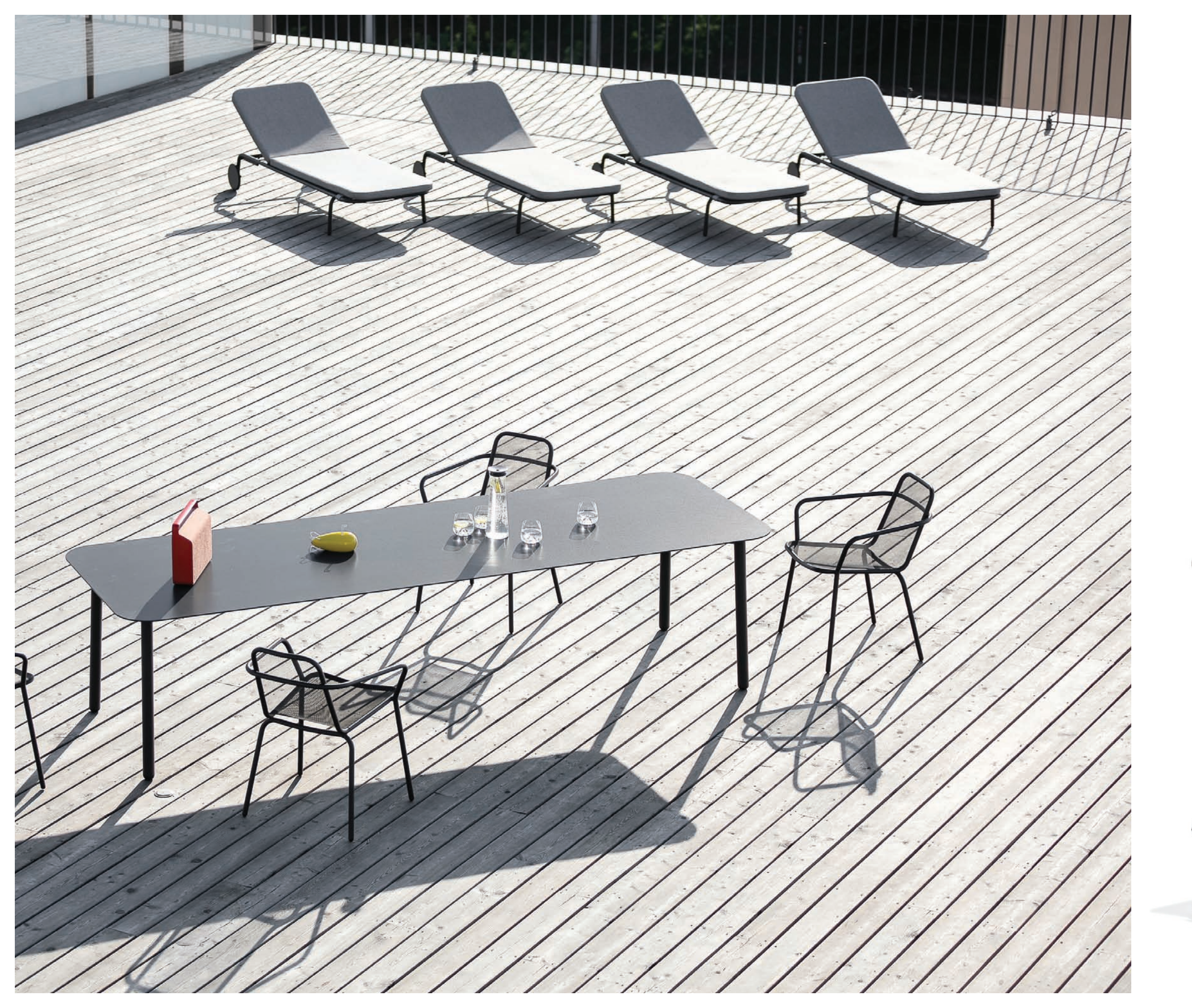
ALL IS QUIET FOR LATE AFTERNOON SIESTA