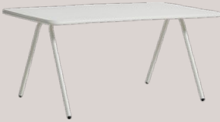
DINING TABLE 160