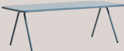
DINING TABLE 220