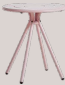
CAFÉ TABLE ROUND