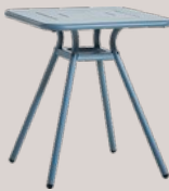
CAFÉ TABLE SQUARE