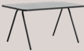
DINING TABLE 140