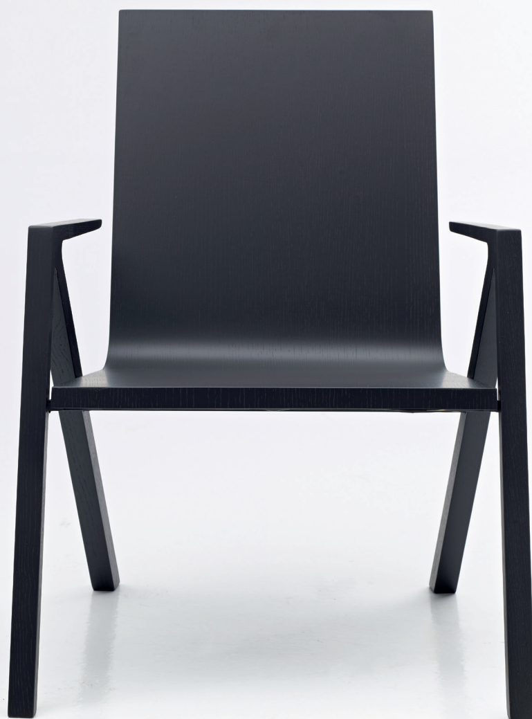
FELIX CHAIR