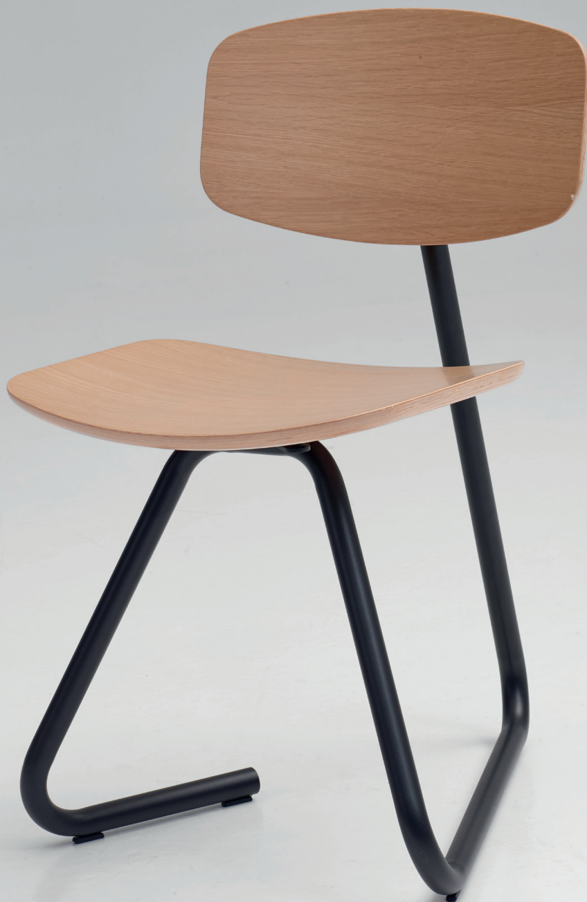
ELEPHANT CHAIR