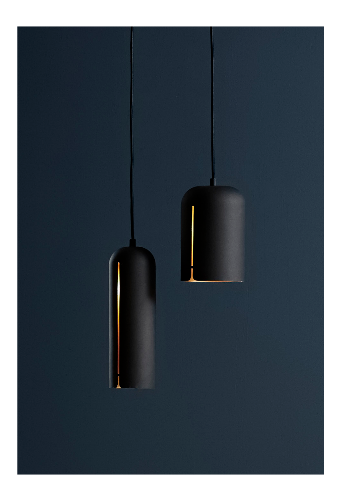
GAP PENDANTS designed by Nur