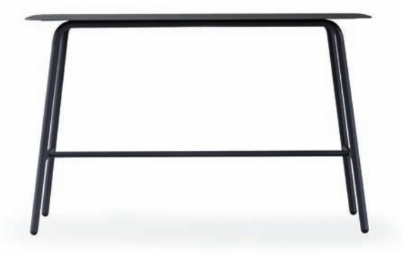
STARLING BAR TABLE CERAMIC/HPL TABLE TOP [ 90 x 90 x 110 cm ] [ 180 x 70 x 110 cm ]