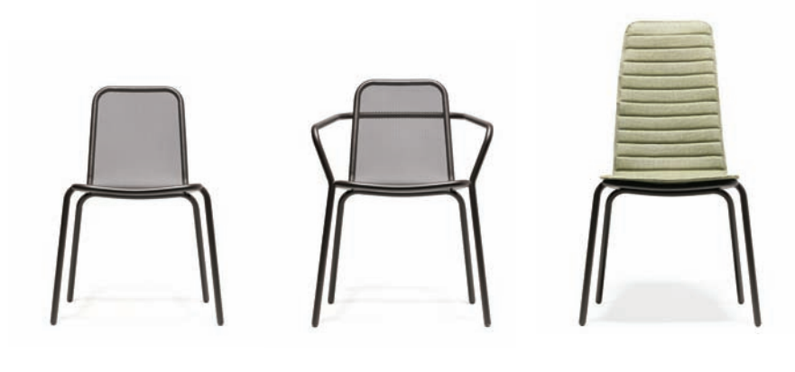
STARLING CHAIR [ 57 x 60 x 78 cm ]