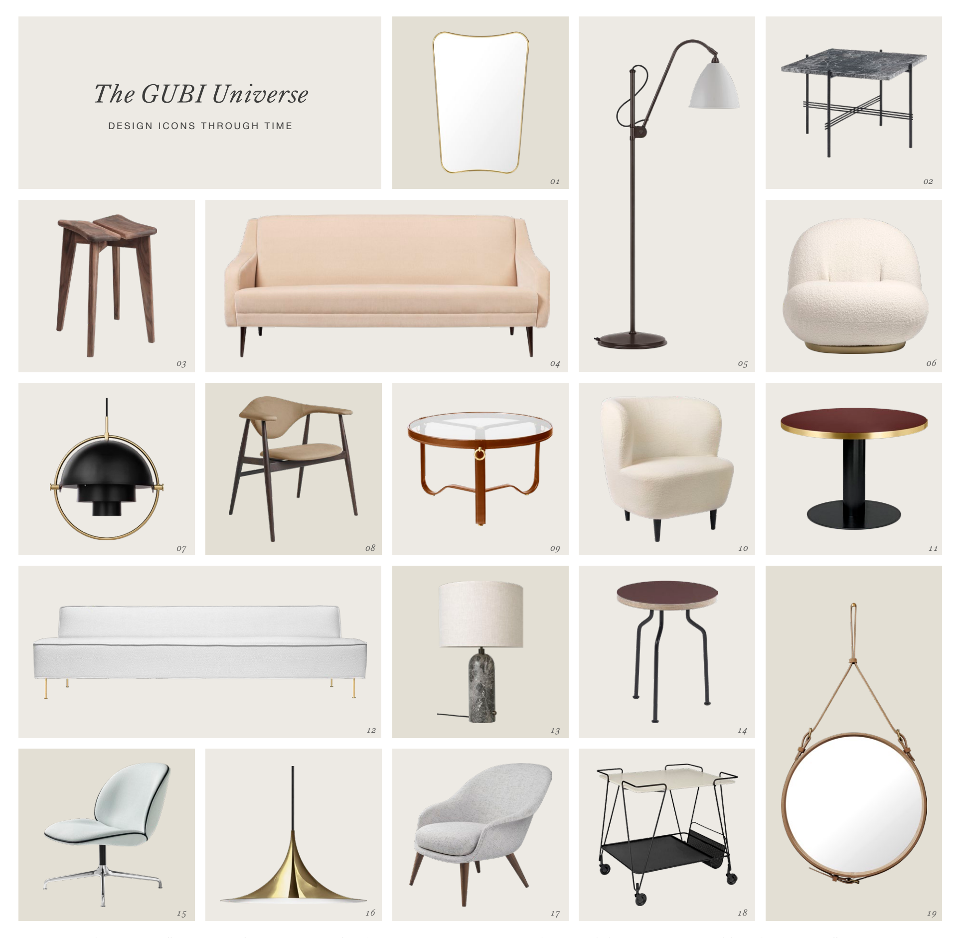
01 - F.A.33 Wall Mirror + 02 - TS Coffee Table + 03 - Trèfle Stool + 04 - CDC.2 Sofa + 05 - BL3 Floor Lamp + 06 - Pacha Lounge Chair + 07 - Multi-Lite Pendant + 08 - Masculo Dining Chair + 09 - Adnet Coffee Table + 10 - Stay Lounge Chair + 11 - GUBI 2.0 Dining Table + 12 - Modern Line Sofa + 13 - Gravity Table Lamp + 14 - Modern Line Side Table + 15 - Beetle Lounge Chair + 16 - Semi Pendant + 17 - Bat Lounge Chair - Low Back + 18 - Matégot Trolley + 19 - Adnet Wall Mirror - Circular