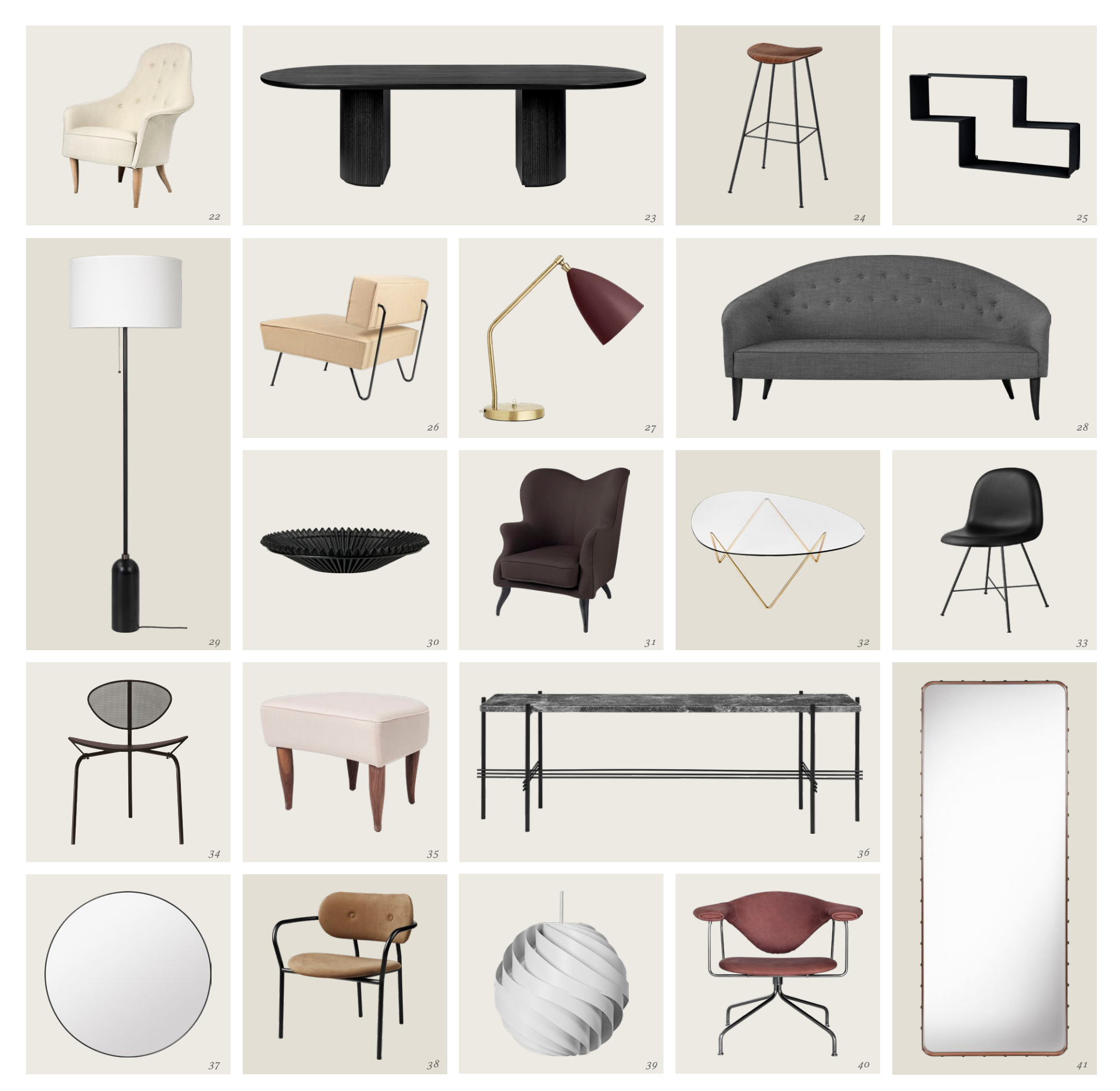
22 - Adam Lounge Chair • 23 - Moon Dining Table • 24 - 2D Bar Stool • 25 - Dédal Shelf • 26 - GT Lounge Chair • 27 - Gräshoppa Table Lamp • 28 - Paradiset Sofa • 29 - Gravity Floor Lamp • 30 - Matégot Bowl • 31 - Bonaparte Lounge Chair • 32 - Pedrera Coffee Table • 33 - 3D Dining Chair • 34 - Nagasaki Dining Chair • 35 - Fig Leaf Ottoman • 36 - TS Console • 37 - GUBI Wall Mirror • 38 - Coco Lounge Chair • 39 - Turbo Pendant • 40 - Masculo Lounge Chair • 41 - Adnet Wall Mirror - Rectangular